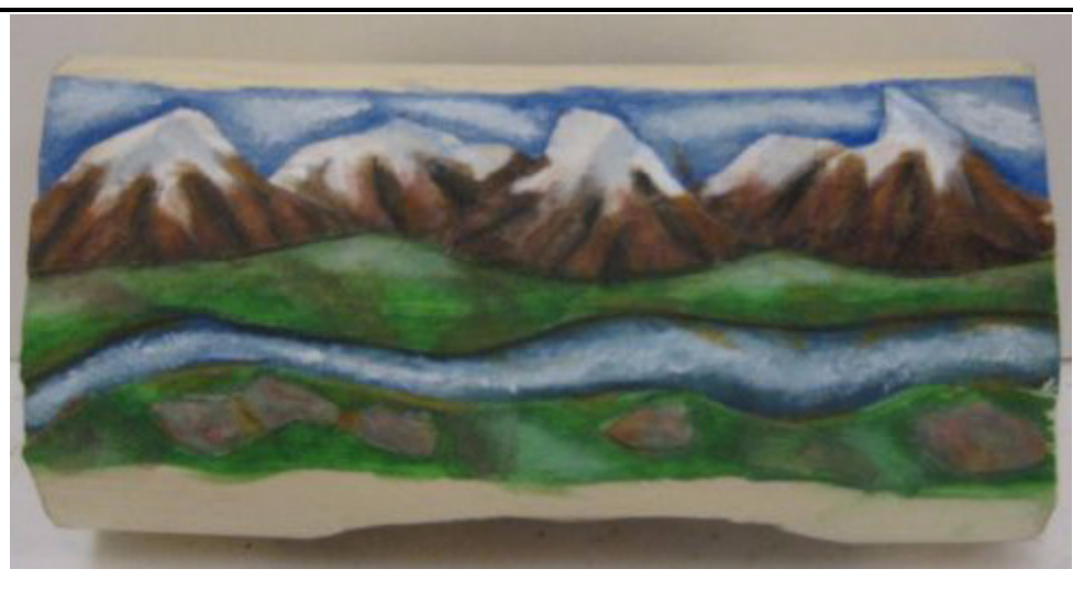
Back Tom Sarff Cypress Knee