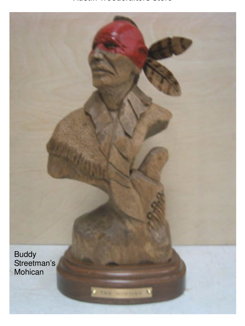
January Meeting Minutes

Next membership meeting February 14, 7:00 PM Austin Woodcrafters Store