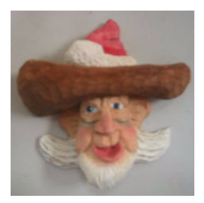
Tom Sarff's example go-by for February blank of the month