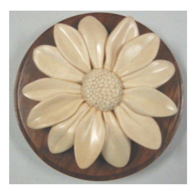
Bill Buckler's January Blank of the Month