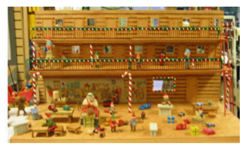
Santa's Workshop Project

Next Meeting Thursday October 11, 2007 7:00 PM Austin Woodcraft Store