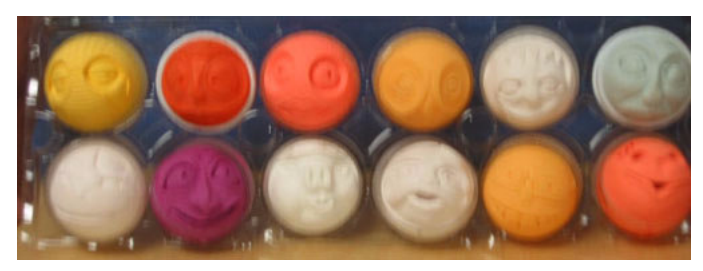
Bill Buckler's Golf Ball carvings