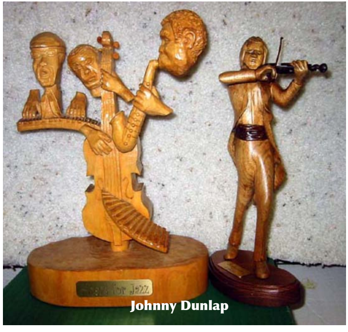
The WoodWorks show has been

WoodWorks Austin, TX December 3 - 5, 2004