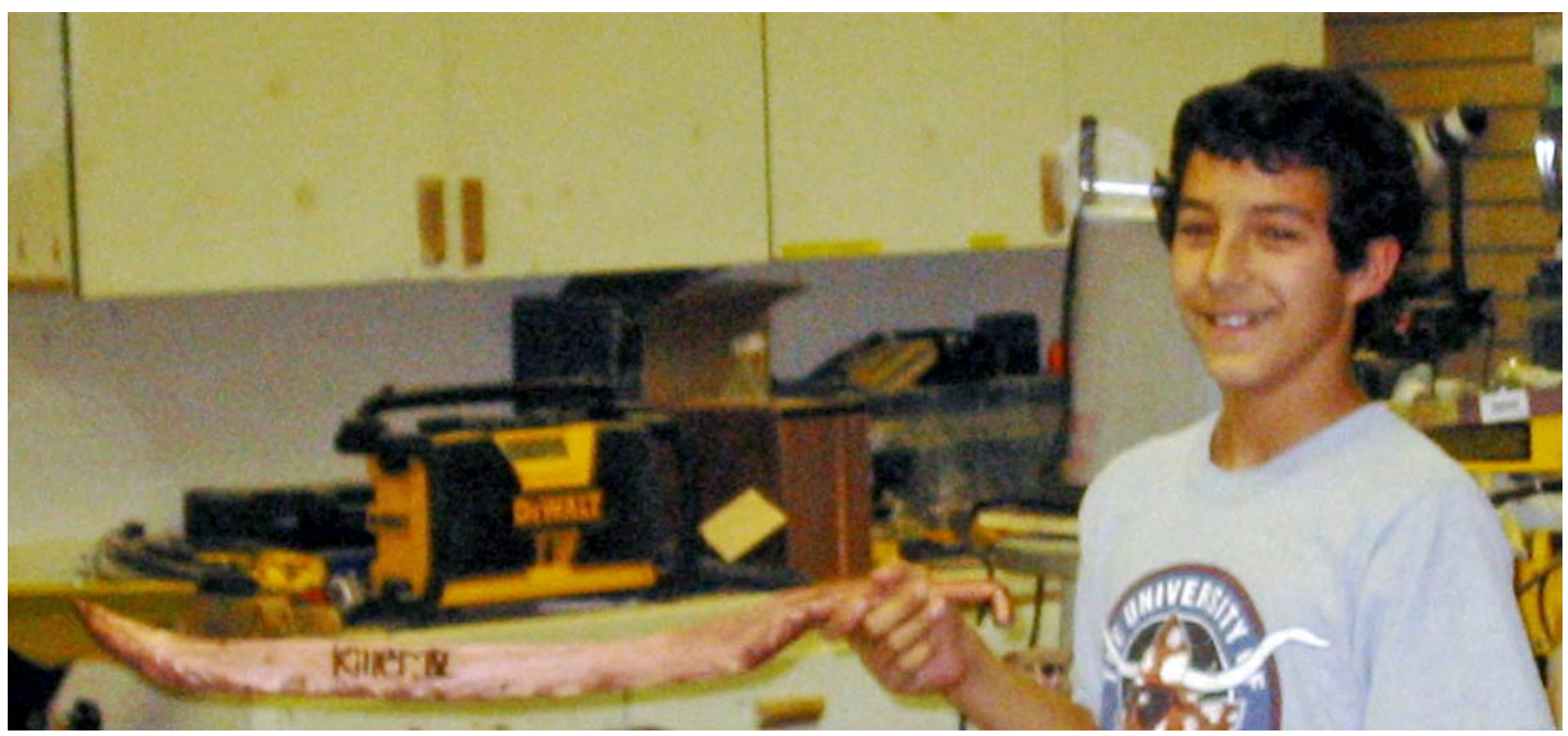
March Show & Tell